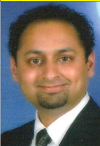
Director of Dermatology Jacobi Medical Center

See February issue of Integument for new faculty profiles