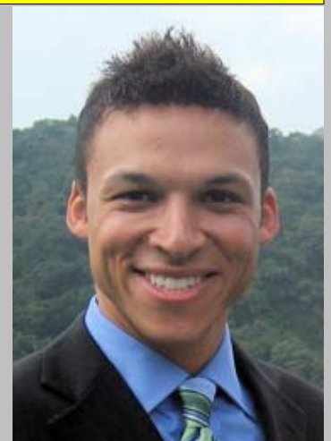
Director of Dermatologic & Laser Surgery

See February issue of Integument for new faculty profiles