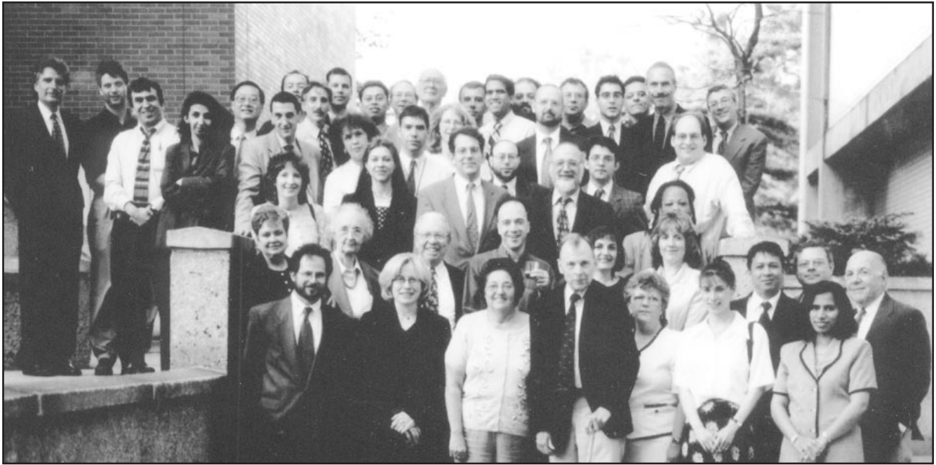
FIGURE 6 | The Neurology Department, 2001: clinical faculty, residents, clinical fellows, and administrators.