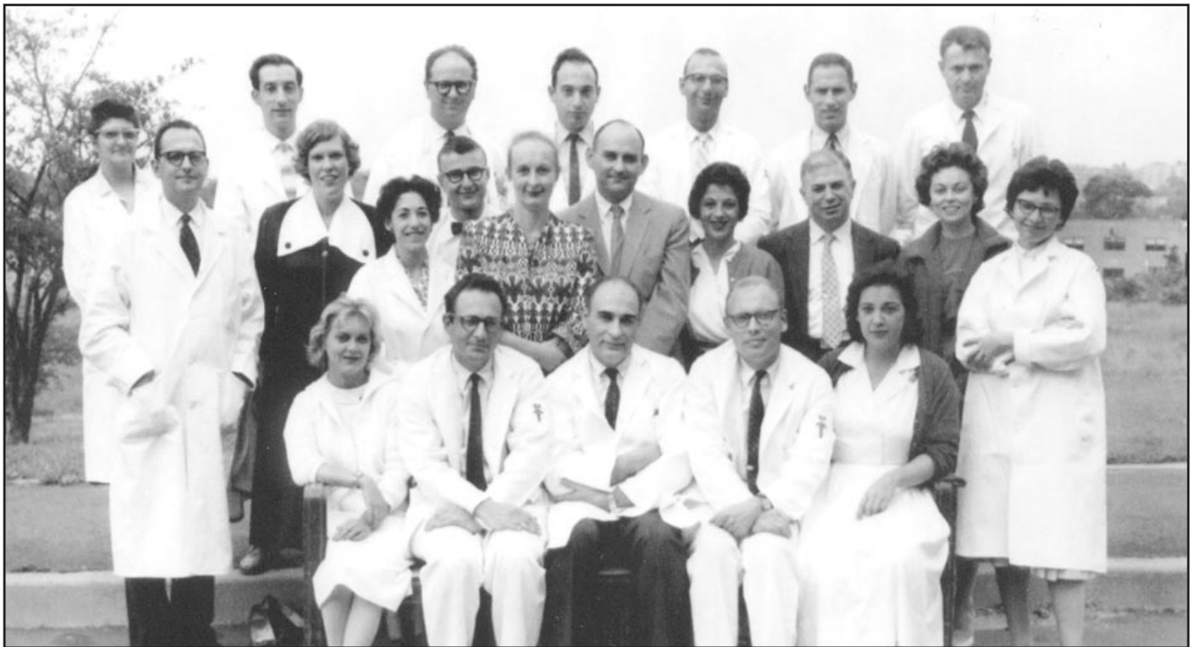
FIGURE 5 | The entire Neurology Department, 1959.

EEG, which flourished under the influence of Pete Engel's clinical work and research on epilepsy, was